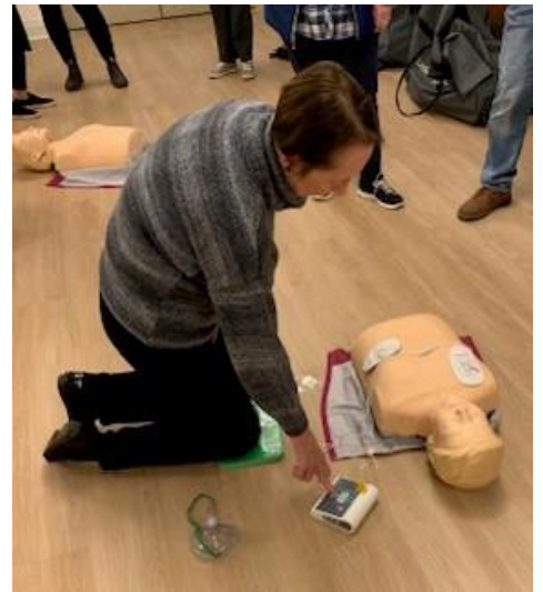
First Aid/AED Training