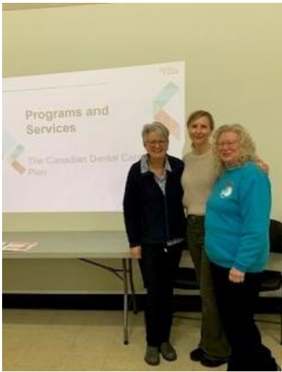
Canadian Dental Care Plan Presentation