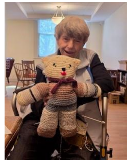
Knit & Natter