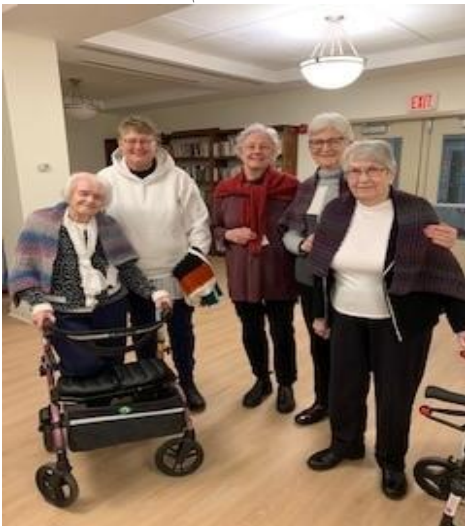
Prayer Shawl Presentations