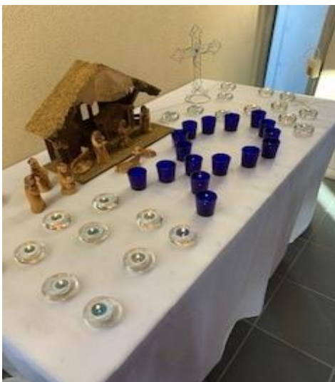
Blue Christmas Service