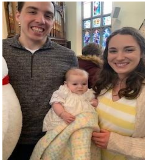
Baptism Prayer Shawl Presentation