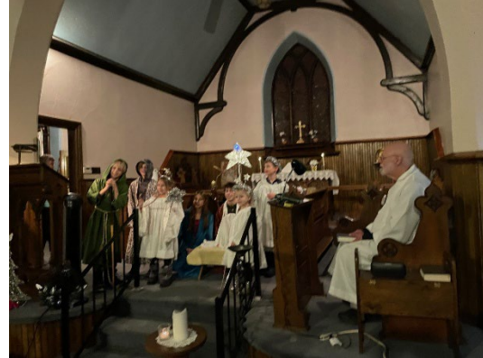
(Children's Christmas Pageant)