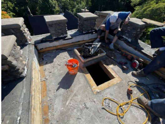
(removing the old roof)